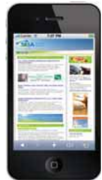
SEIA Solar Update Weekly eNewsletter

This is your perfect chance to reach key decision-makers in the solar energy industry. Call your Naylor account representative to reserve your space today!