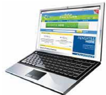
Solar Buyers' Guide