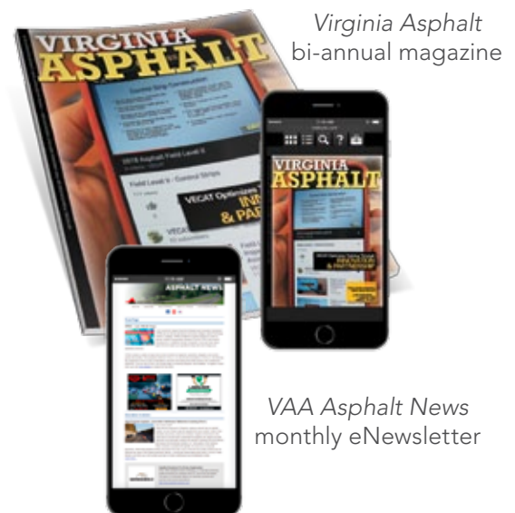
Virginia Asphalt bi-annual magazine