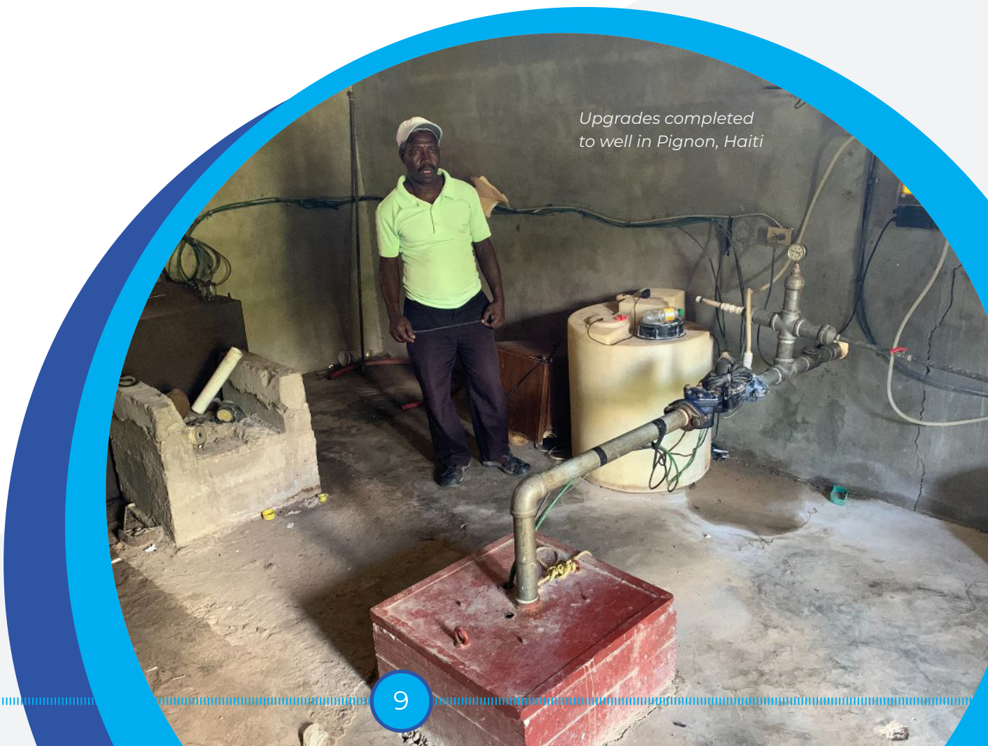
Upgrades completed to well in Pignon, Haiti

These developments highlight OWB's expanding influence and effectiveness in addressing water and wastewater management challenges globally, particularly in regions prone to natural disasters and lacking robust infrastructure.